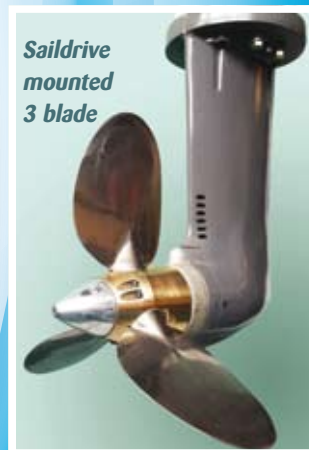
Saildrive mounted 3 blade

Download your fitting template on website